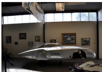
Streamline car →